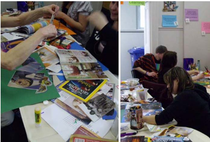
YES Workshops: Making collages helps answer the question: "What do you want to be when you grow up?"

A few weeks ago, during one of our workshops, we encouraged the youth to think beyond their current needs, imagine the future and attempt to answer the question, "What do you want to be when you grow up?" Together we made collages representing their long-term career goals and aspirations. Of the girls, future careers included youth worker, flight attendant, and dental hygienist. Of the boys, future careers included professional sports, plumber, and fire fighter. Statistics tell us that of today's homeless population in greater Vancouver, 60% of these individuals were once in foster care. It's exciting to realize that the kids at Aunt Leah's can realize their dreams. They can be like many of us when we were their age. It's easy to look at them and not see what makes them different. What they don't have enough of is support, family and community. Aunt Leah's provides this. Through your support, we are changing those frightening statistics, and the future for foster children.